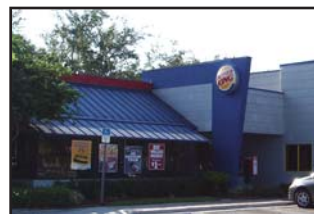
Burger King Winter Springs (Orlando), FL