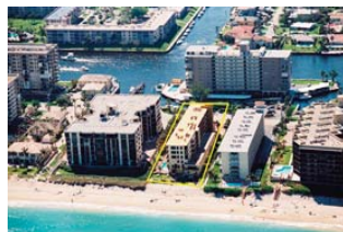
Seabonay Hillsboro, FL