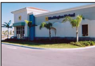
Washington Mutual Miami, FL