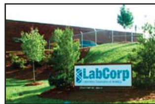
Lab Corp. Winston-Salem, NC