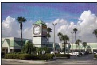
Clocktower Shopping Center Cutler Bay (Miami), FL