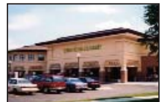
Wild Oats Westminster (Denver), CO