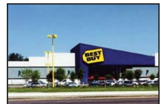
Best Buy West Palm Beach, FL