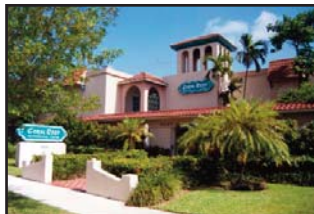
Coral Reef Professional Center Palmetto Bay (Miami), FL